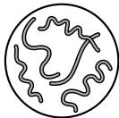
spiral, e.g. causing syphilis