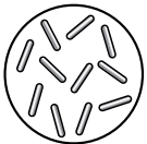
rod-shaped, e.g. causing anthrax